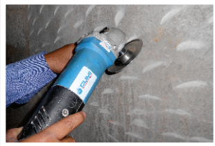
Hacking - Wall