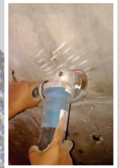
Hacking - Ceiling