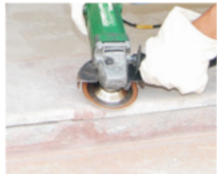
Marble / Tile finishing