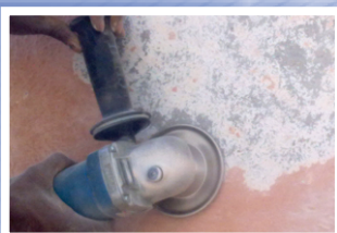
Rendering / Colour Peeling & Preparing Surface for Painting