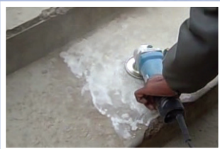
Slurry Removal - Floors