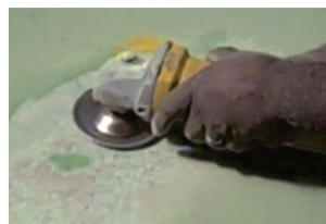
Epoxy Removal - Floors