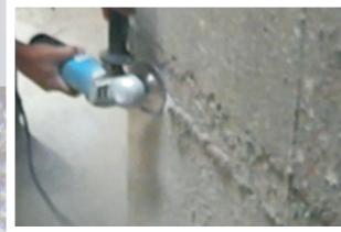
Merging / Leveling after De-shuttering