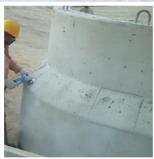
Remove Bulges & Offsets